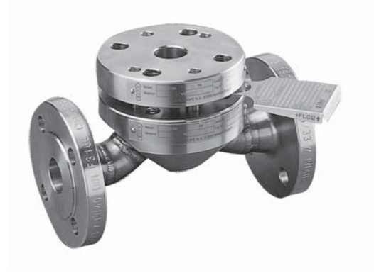
Viscous Tee Holder

When ordering Viscous Tee Holders, specify size (nominal pipe size of installation), ANSI rating, type of rupture disc to be used, rupture disc outlet companion flange requirements and material requirements.