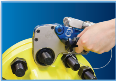
HTL W Torque Wrench + HTL-L Low Profile