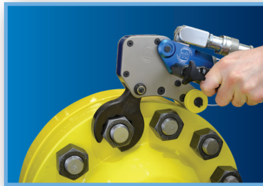
HTL W Torque Wrench + HTL-R Ultra-Low