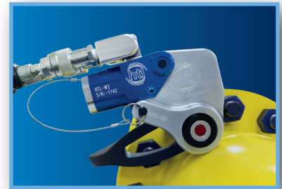
HTL W Torque Wrench + HTL-S Square Drive