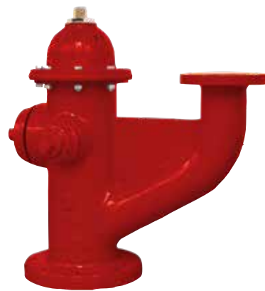
Monitor Style Super Centurion Fire Hydrant (A-479)