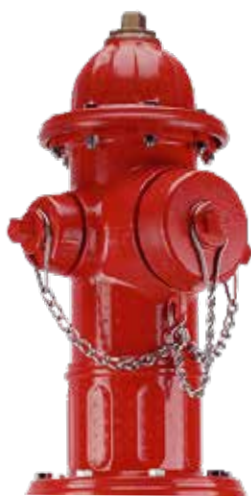
Super Centurion® 250™ Fire Hydrant (A-423)