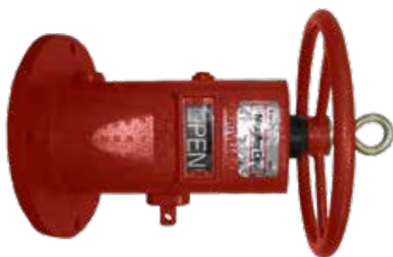
Wall-Type Indicator Post (A-20814 4"-14")