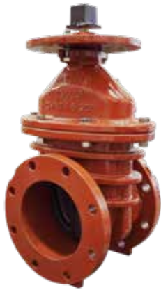
350psi Post Indicator Resilient Wedge Gate Valve (PIV) (P-2361)

Mueller UL listed and FM approved check valves are gravity operated, swing check design. These check valves are rugged in construction and simple in design. Our 2-12" sizes are now rated at 350psig and feature ductile iron construction, EPDM disc seat and bronze body seat rings as standard.