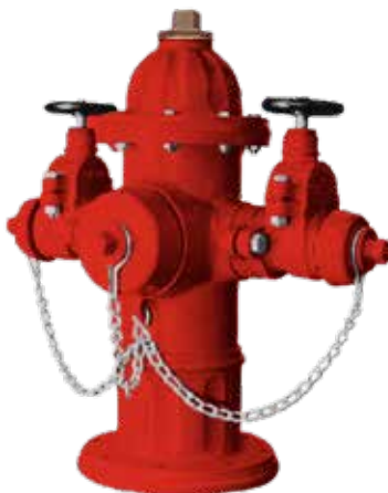
Super Centurion 250 with Independent Hose Gate Valves (A-423-370)