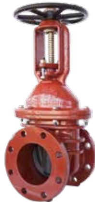
OS&Y Resilient Wedge Gate Valve (R-2361)