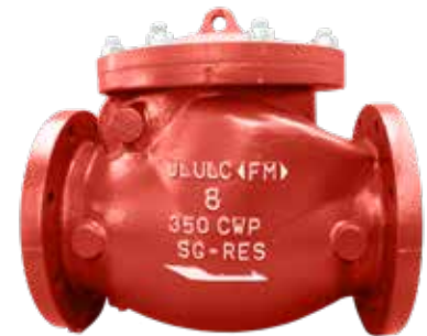
350psi Swing Check Valve (A-2120-6BB)